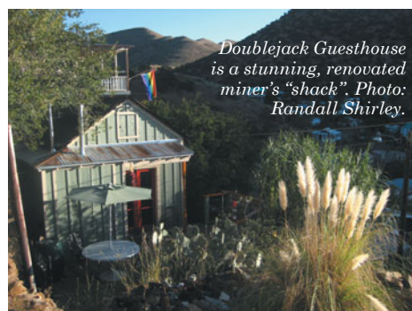
Doublejack Guesthouse is a stunning, renovated miner's "shack".