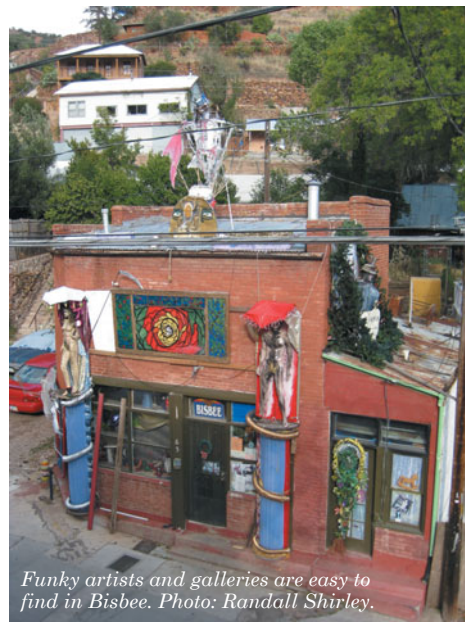
Funky artists and galleries are easy to find in Bisbee.